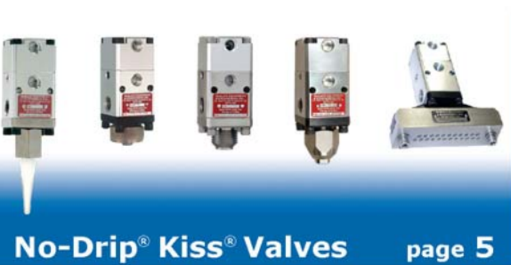
No-Drip® Kiss® Valves