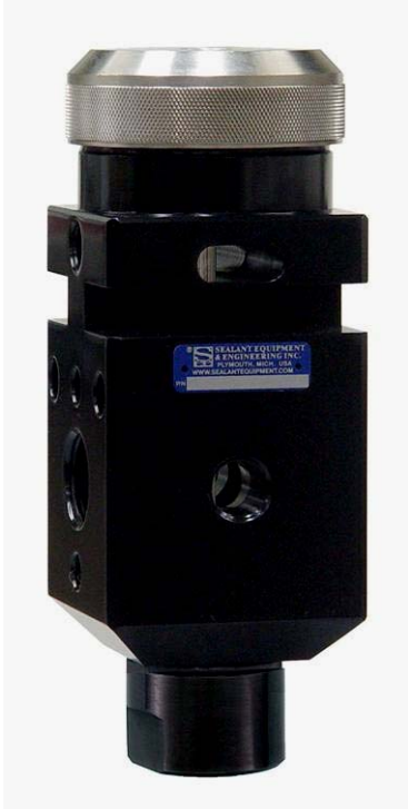
2200-033-011 Series High-Volume Snuf-Bak Dispense Valve