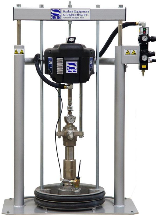
55 Gallon Ram Pump Assembly